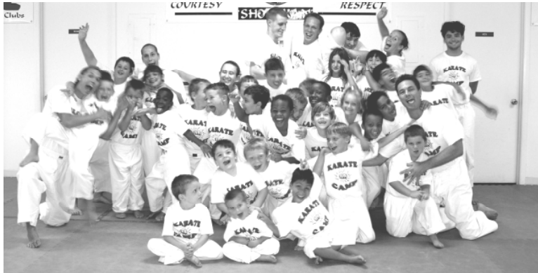
BEFORE KARATE CAMP