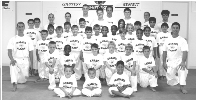
AFTER KARATE CAMP

Special Price $250 FAMILY DISCOUNT: $200.00 EACH (1 or more registrations from the same family)