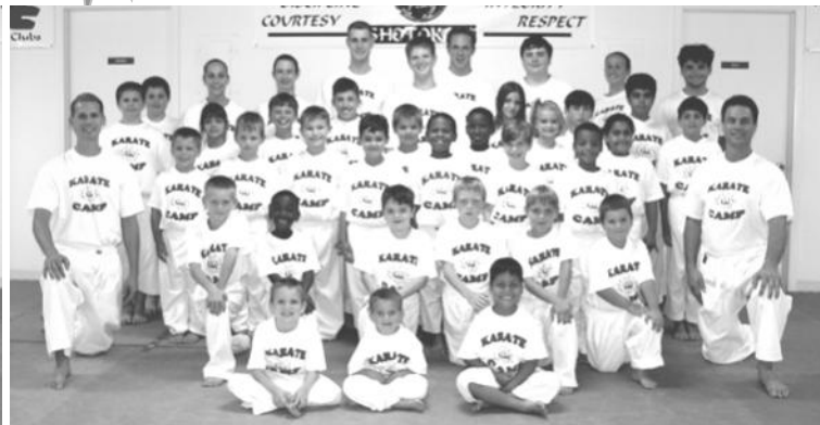
BEFORE KARATE CAMP